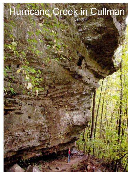
Hurricane Creek in Cullman

For more information: http://hurricanecreek.homestead.com/index.html