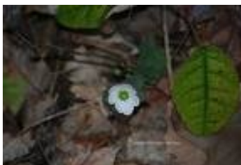
Join us March 26th for a Field Trip to the Pocket.