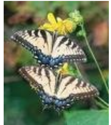
Easter Tiger Swallowtails female March 7th Potluck Supper 6:30pm BBG