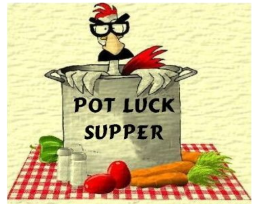
Bring your favorite dish! We start at 6 pm

state and other parts of the Southeast. Both are long-time members of the Blanche Dean Chapter. The two continue to collaborate on butterfly-related projects.