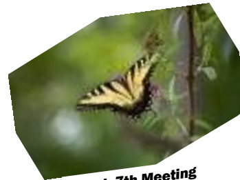
March 7th Meeting